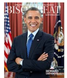
President Barack Obama 2016 Commencement Orator